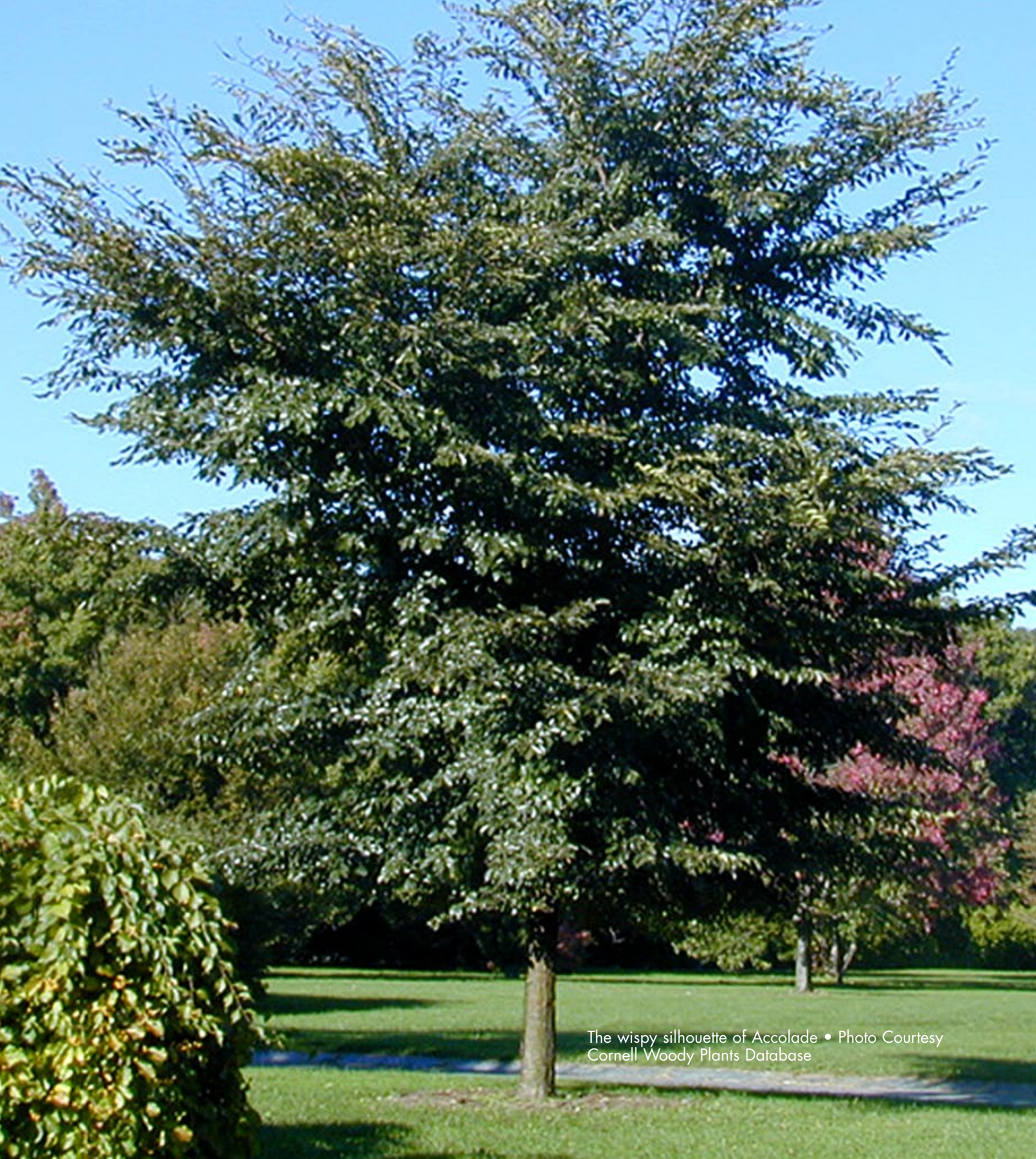
The wispy silhouette of Accolade

Accolade™ is the trade name and ‘Morton’ is the cultivar name for the hybrid Asian elm tree that’s been named SMA Urban Tree of the Year 2012. (Here we refer to it simply as Accolade.) Accolade’s parents are Ulmus japonica and U. wilsoniana , and it’s this hybrid that jump-started the Morton Arboretum’s elm improvement program in 1972.