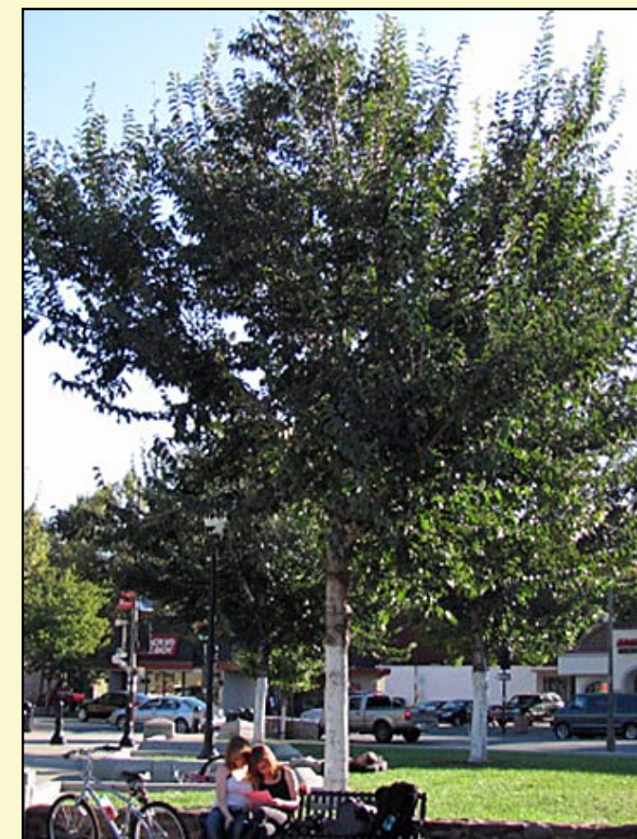
Chico, California Accolade in 2006 (left) and (right) the same tree in 2011