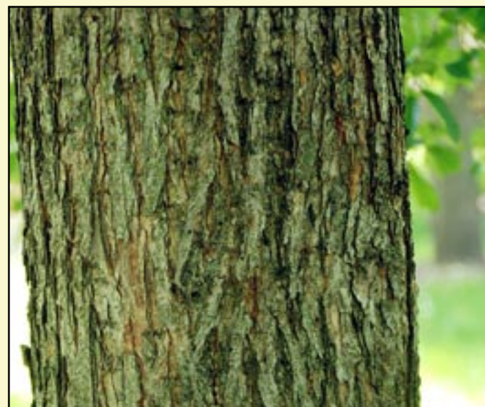
Accolade trunk