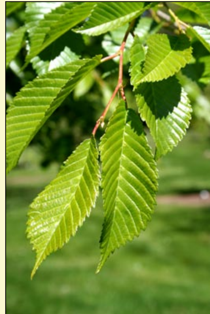
The rich green, glossy foliage of Accolade

Accolade demonstrates an ultimate habit that is upright and American elm-like, but more compact. It can be expected to reach 40 to 60 feet (12.2 to 18.3 m) in height and 35 to 40 feet (10.7 to 12.2 m) in spread. It is reliably hardy to Zone 4.