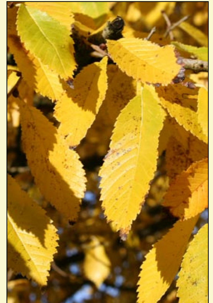
Accolade fall color