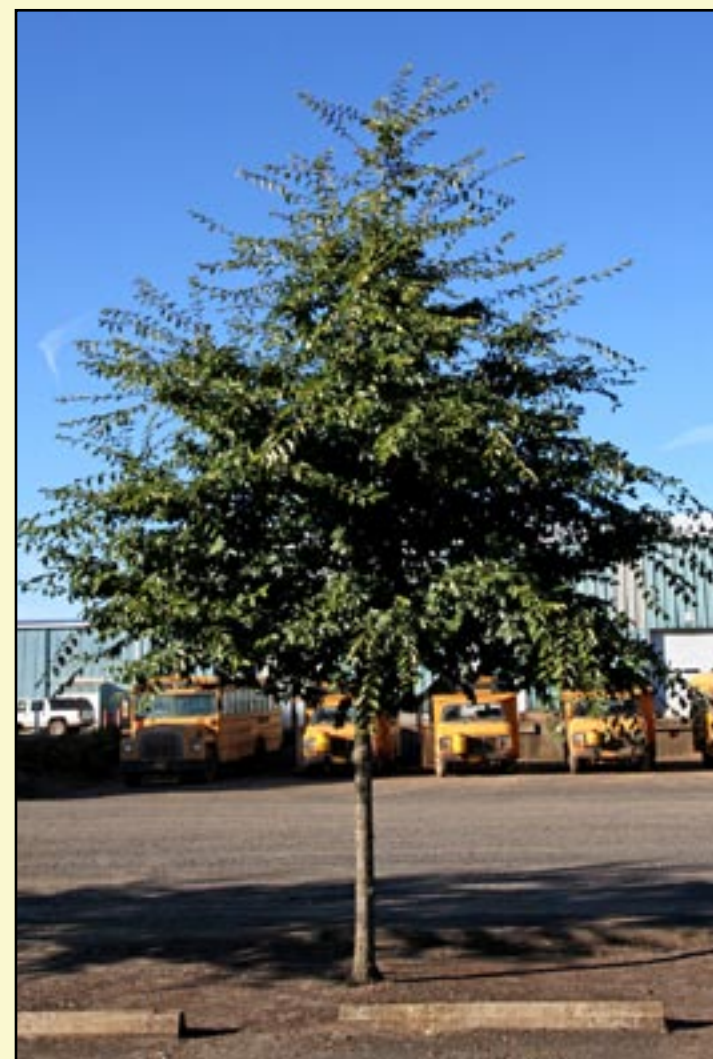
Accolade performs well in a parking lot trial conducted by J. Frank Schmidt & Son Co.