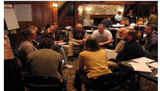
Real-Life Problem Solving Sessions