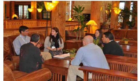
Small Group Discussions and Exercises

For sponsorship opportunities, contact SMA at urbanforestry@prodigy.net