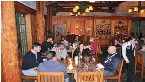
Dining Together - Additional Networking

The MFI is a program of the Society of Municipal Arborists