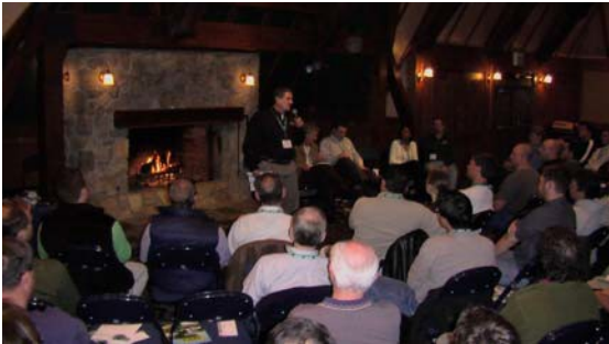
Presentations from Experienced Instructors